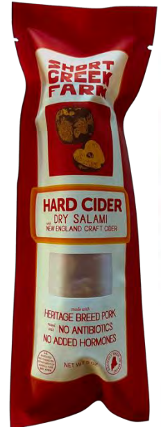
Hard Cider Chub