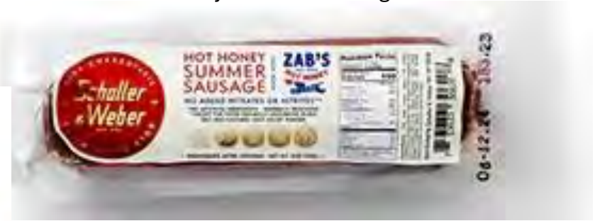
Hot Honey Summer Sausage