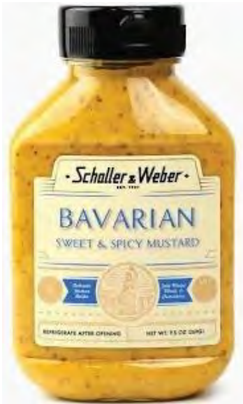
Sweet & Spicy Mustard