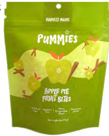
Nostalgic apple pie flavors of cinnamon & nutmeg

These fruity little bites are fun, flavorful, and seriously snackable. When fruit gets juiced, the leftover “pomace” is usually tossed — even though it’s packed with fiber and nutrients. Harvest Maine gives it new life by turning it into these first-of-its-kind fruit bites. Healthy snacking made simple