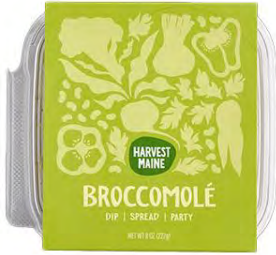
All the flavors of guacamole, but with Maine broccoli