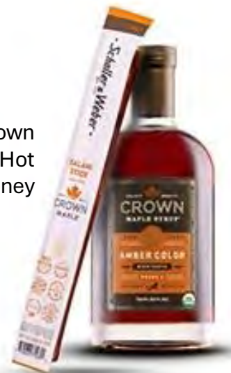
Snack Sticks: Crown Maple, Rye Whiskey, Hot Honey