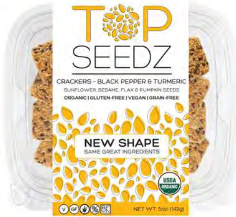
NEW FLAVOR! Black Pepper & Turmeric Crackers