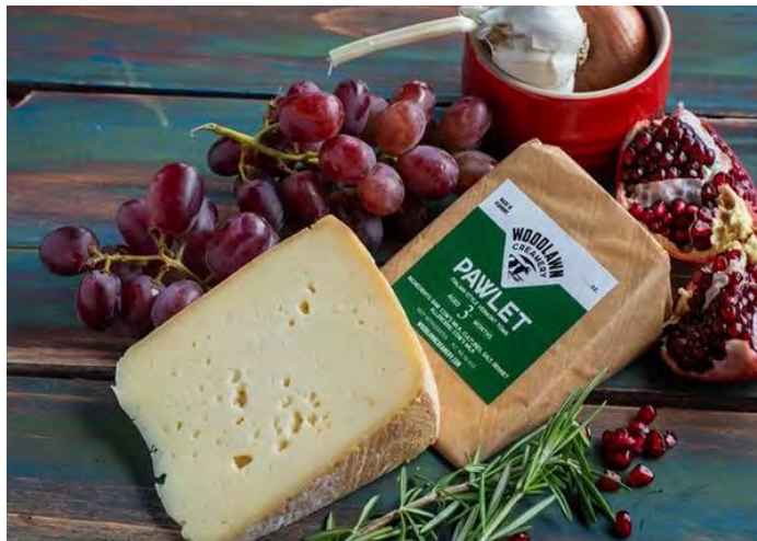
PAWLET: Milk: Raw Cows Milk Style: Italian-Style Toma, Washed Rind Aged: 3-6 months Flavor Profile: Mild, Buttery, Grassy, Nutty