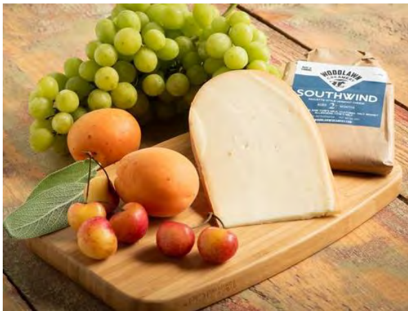
SOUTHWIND: Milk: Raw Cows Milk Style: Raclette-Style Vermont Aged: 2-6 months Flavor Profile: Mild and Milky Best Enjoyed: Melted