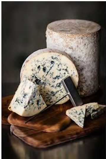
Bayley Hazen Blue