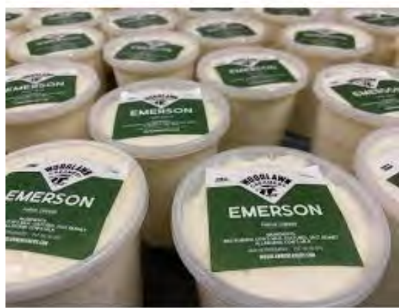
EMERSON: Pasteurized Cows Milk Style: Farmer's Cheese Aged: Fresh Flavor Profile: Mild and Milky