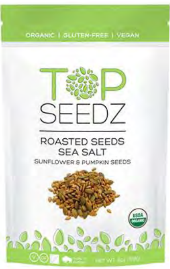
Sea Salt Roasted Seeds