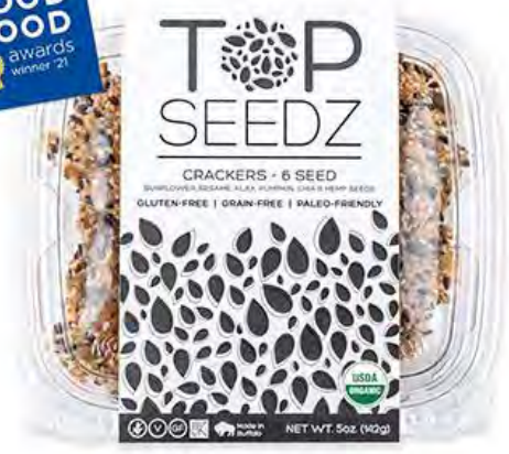
6 Seed Crackers