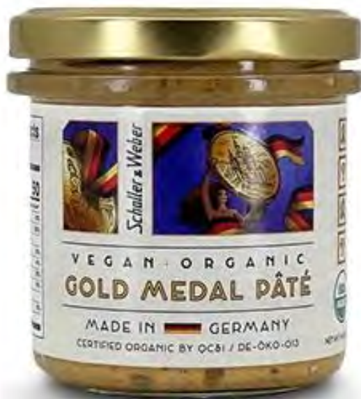
VEGAN Gold Medal Pate