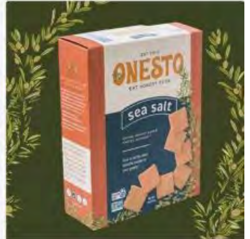
Gluten Free Crackers