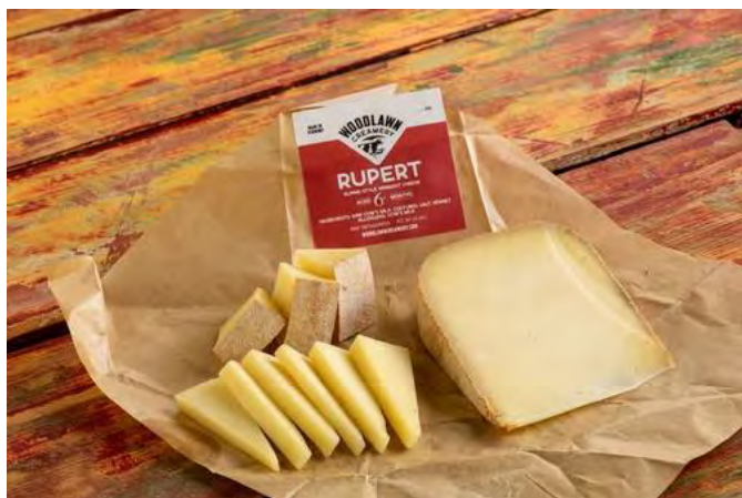
RUPERT: Raw Cows Milk Style: Alpine-Style Vermont Cheese Washed Rind Aged: 6-12 months Flavor Profile: Fruity, Butterscotchy, Complex