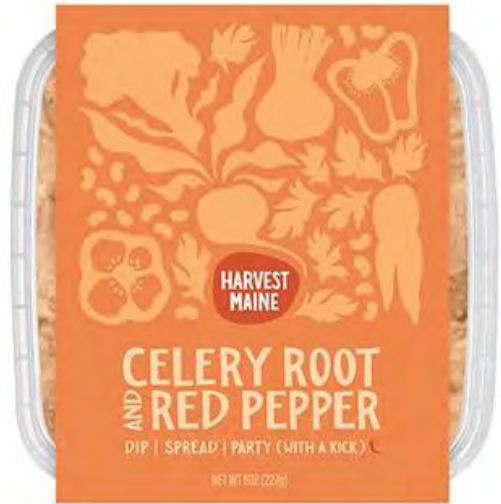
Refreshingly unique celery root flavor with a little red pepper kick