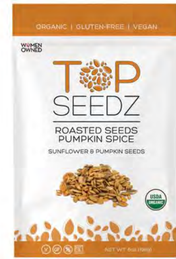
Pumpkin Roasted Seeds