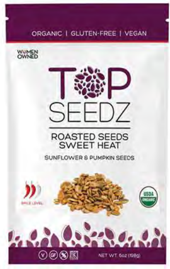
Sweet Heat Roasted Seeds