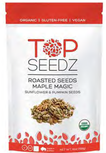
Maple Magic Roasted Seeds