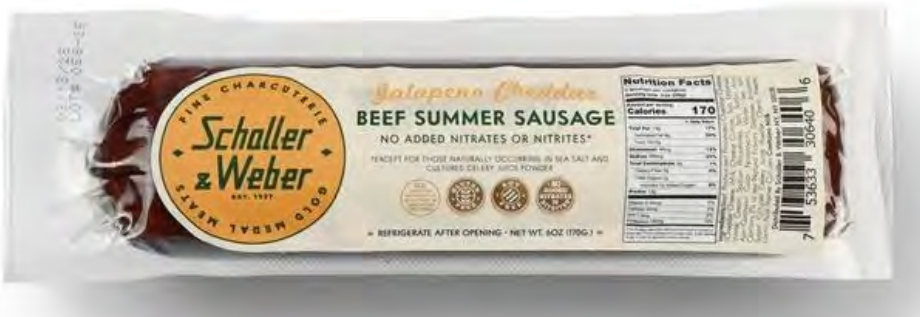
Jalapeno Cheddar Summer Sausage