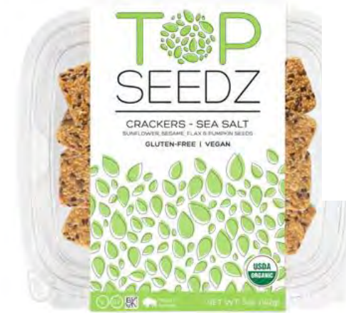
Sea Salt Crackers