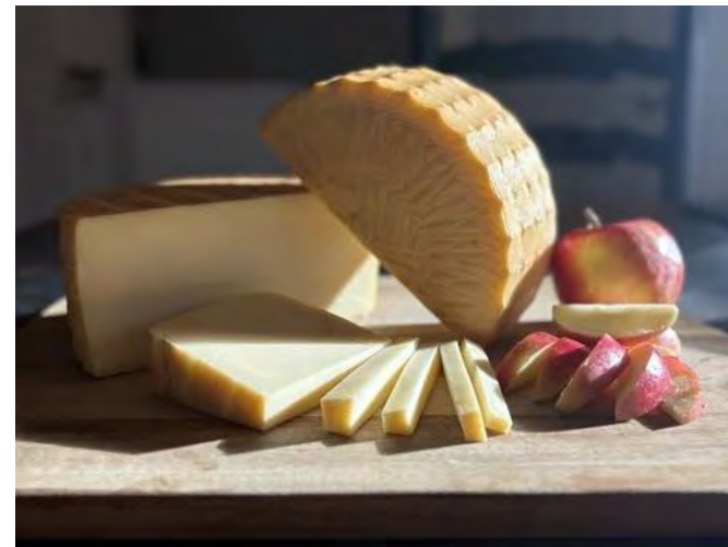
OXBOW: Milk: Raw Cows Milk Style: Apple-wood Smoked Aged: 2+ months Flavor Profile: Mild and Milky with just a Hint of Smoke