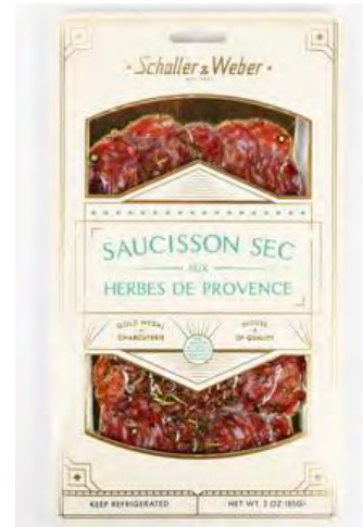
Herbs de Provence sliced packs