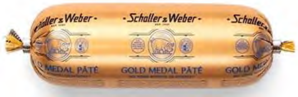
Gold Medal Pate