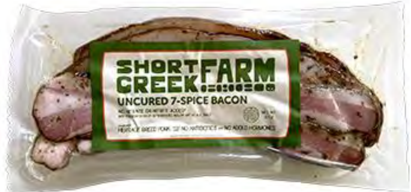
7 Spice Bacon