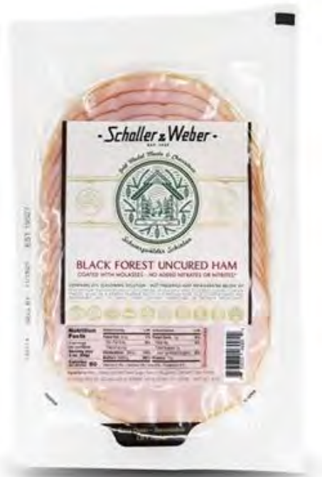
Sliced Black Forest Ham