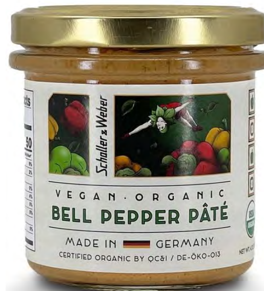
Bell Pepper Pate