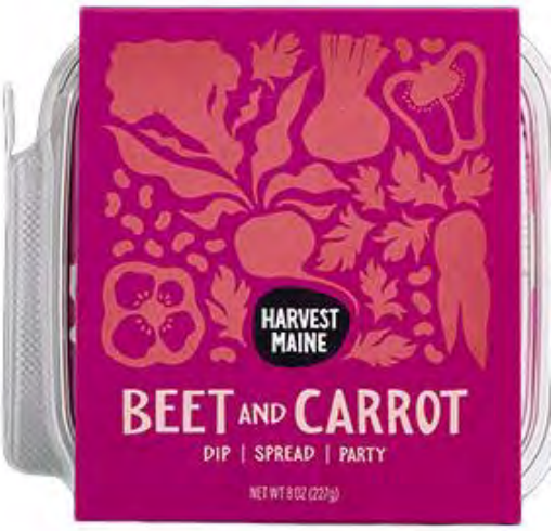
Robust beet flavor, balanced with the sweetness of carrot

Harvest Maine takes imperfect-but-awesome veggies from local farms and give them a tasty second life as smooth, flavor-packed spreads. They're great on chips, crackers, sandwiches — honestly, just about anything. Upcycling never tasted so good.